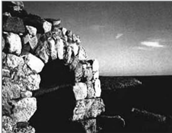
Entrance to the "Gates of Hades"

Because of the nature of its procurement the booty was henceforth considered cursed and no one dared to steal it anymore.