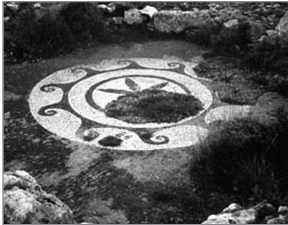
The Psychomantium of Poseidon

Near the Gates of Hades, which is a hole now covered with concrete slabs, is the Psychomantium of Poseidon, the Oracle of the Souls. A psychomantium is an ancient form of mirror gazing which is used to contact spirits of departed loved ones. Near the Poseidon's oracle there is yet another enigmatic spot. In the middle of a land surface littered by thousands of rocks in various sizes there is a bare circular area cleared by any rock or pebble whatsoever. Not far from the Tainaro Cape, in the place called Phrearton Inousson, there is where the greatest abyssal zones of the Mediterranean are hidden, about 4850 meters deep.